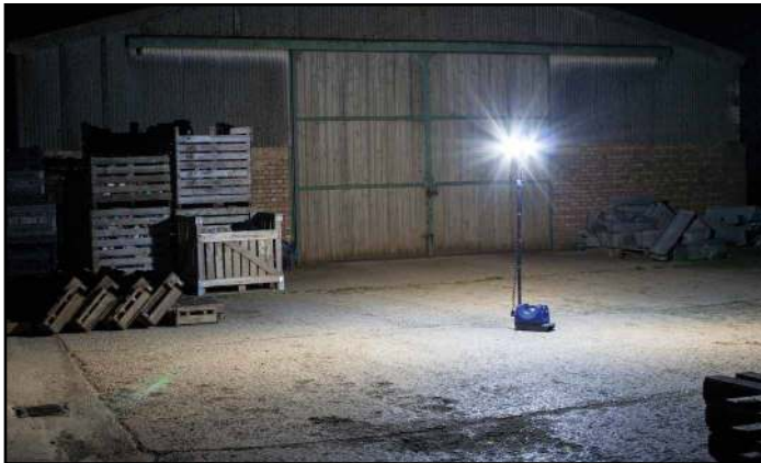
360° area flood lighting