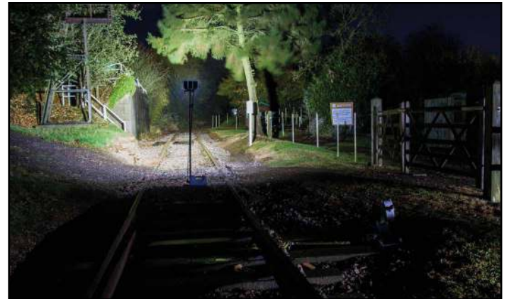
180° directional area flood lighting